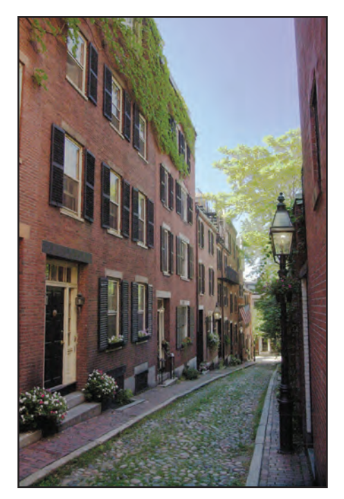
Historic Beacon Hill

Enjoy a welcome dinner at the Union Oyster House, America's oldest restaurant and a National Historic Landmark, and accommodations at The Boxer Hotel, a newly renovated boutique hotel in Boston's historic (1904) Flatiron Building.