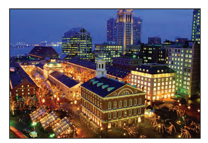
Faneuil Hall Marketplace

Farms Afield fees: $1350 per person based on double occupancy; $300 supplement for a single room. Fees include 3-night accommodations, 5 meals (daily breakfast and 2 dinners), and all planned activities. Farms Afield: Boston is a Member Exclusive. Space is limited. Early registration is encouraged. By prior arrangement, attendees are welcome to pay trip fees in installments.