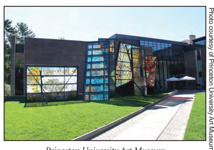
Princeton University Art Museum

Advanced registration is required. For more information and to register, visit StickleyMuseum.org.