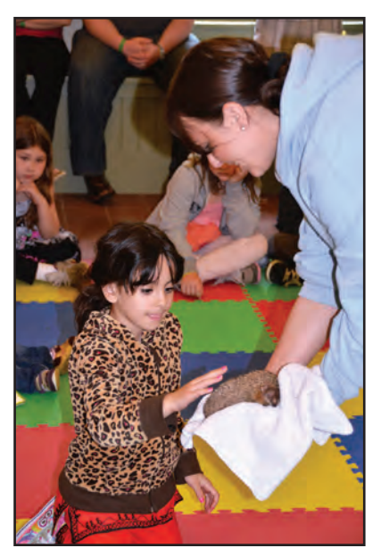
Petting a hedgehog.