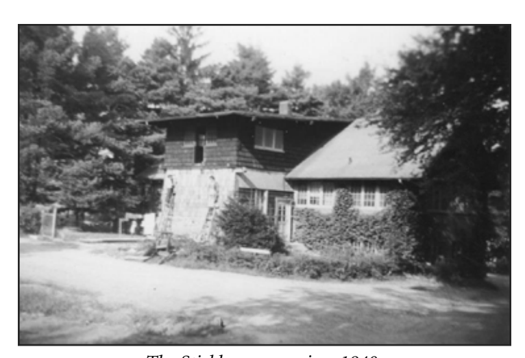
The Stickley garage circa 1940s

The museum's Trustees invite you—our members and friends around the world—to join us in building the future of the Stickley Museum at Craftsman Farms! We will be launching a capital campaign in the coming months to support all aspects of this important building project, from beginning to end. Help us make this transformative vision into a reality that will advance the museum's mission and nurture its growth for generations to come. Watch for more information about how you can be a part of it!