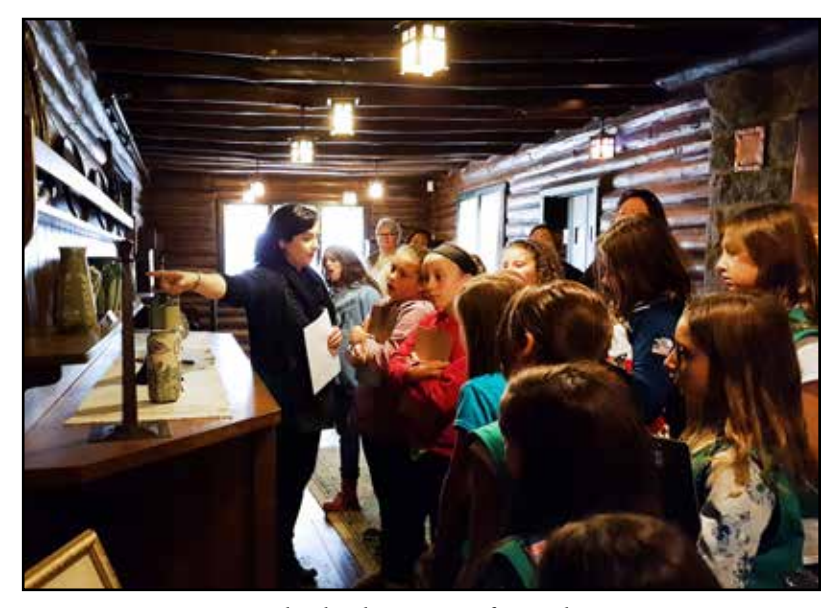
McCauley leading a tour for Girl Scouts during the Newcomb pottery exhibition.

boards at school, and online video tutorials for just-about-anything—they are great multi-taskers, and they are more likely than previous generations to follow non-traditional paths in life, thanks in part to seeing older generations struggle economically during and after the recession. This generation is huge and hugely diverse. And they are our future. They're paying attention. And if recent current events are any indication, they are not content with the