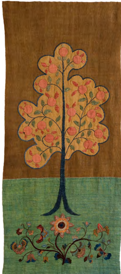
Deerfield Society of Blue and White Needlework, Apple Tree, c. 1902.